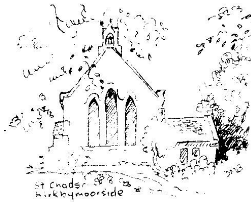
St Chads Kirkbymoorside

Our Lady and St Chad's church building was erected in 1897. The church contains a reredos or altar panel from Gilling Castle that was carved in the early 17th century and the bell tower holds a single bell cast in France in 1903. The church was founded, and is served by, the Benedictine monks of Ampleforth abbey.