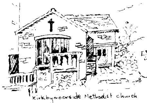
Kirkbymoorside Methodist church

Services: Sundays at 10.30am and 6.30pm except – 3 rd Sunday of each month – Folk & Faith at 7.00pm with light refreshments from 6.30pm 4 th Sunday of each month – Café worship at 4.00pm