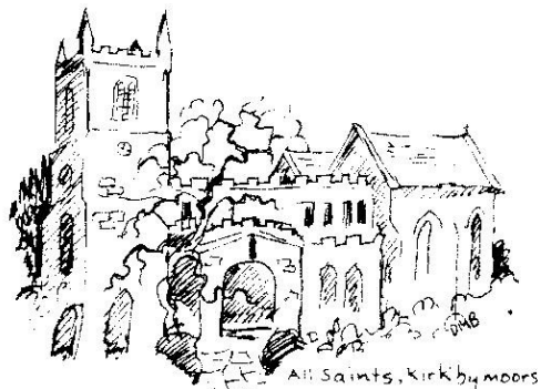
All Saints, Kirkbymoorside

There has been a church on this site since the 9th century. The chancel is 13th century in parts but the church was restructured in 1874. The rare two-storey porch, containing a parvise or priest's room, originates from the 15th century and the tower was re-built in 1802.